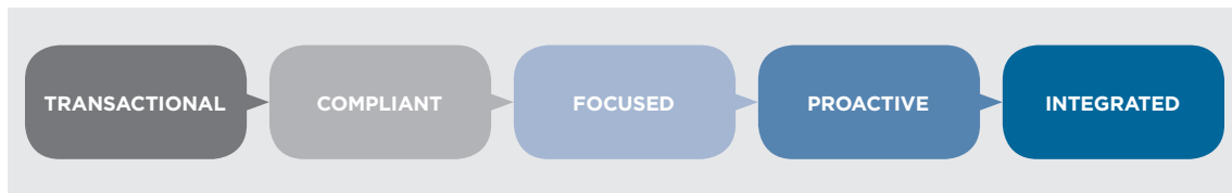
Figure 1: Safety Governance Pathway

Safety governance is the relationship between board members and senior executives in the safety leadership of an organisation. It provides the structure through which the vision and commitment to safety is set; agreement on how safety objectives are to be attained; the framework for how monitoring performance is to be established; and a means for ensuring compliance with relevant safety legislation 10 . Understanding where an organisation currently sits on the Safety Governance Pathway is essential for understanding where senior executives and boards are starting from in their approach to safety governance and determining a vision for where an organisation might like to move to.